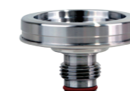
190100-73 Adaptor for Millipore disposable plastic funnel