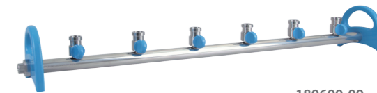
180600-00 MultiVac 600 6 Places Stainless Steel Manifold

Step 2. Choose the disposable funnel and adaptor