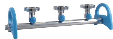
180300-02 MultiVac 300-MB 3 Places Stainless Steel Manifold