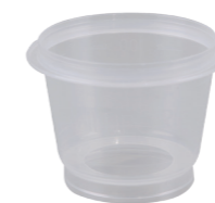
MIACFD101 / MIACFD201 Millipore, 100ml / 250ml Microfil, disposable plastic funnel