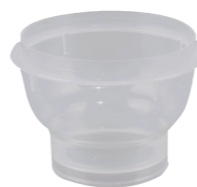
16A07 Sartorius, 100ml disposable plastic funnel

Step 2. Choose the disposable funnel and adaptor