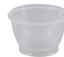
4870 / 4871 Pall, 100ml / 250ml disposable plastic funnel