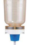
200500-01 500ml MF 5, Magnetic filter holder