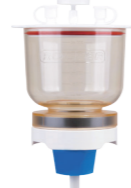
200300-01 300ml MF 3, Magnetic filter holder