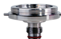
190100-74 Adaptor for Sartorius disposable plastic funnel