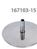
167103-15 Stainless steel cover for 500ml funnel