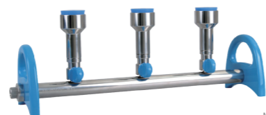
180300-01 MultiVac 300-MS 3 Places Stainless Steel Manifold