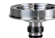
190100-75 Adaptor for Pall disposable plastic funnel