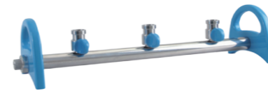
180300-00 MultiVac 300 3 Places Stainless Steel Manifold