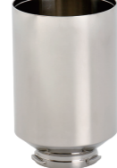
167103-65 500ml Stainless steel funnel