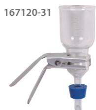
167120-31 300ml Glass filter holder