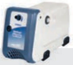
Models 2032 / 2042 DRYFAST® Ultra