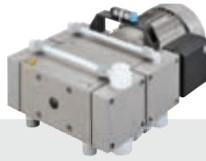
Models 2052 / 2054